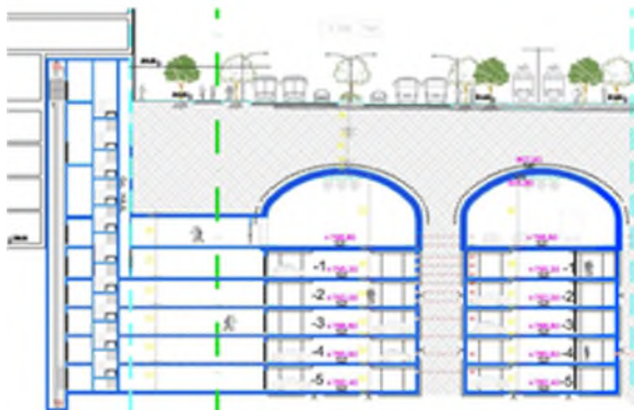
The shazar Underground Parking